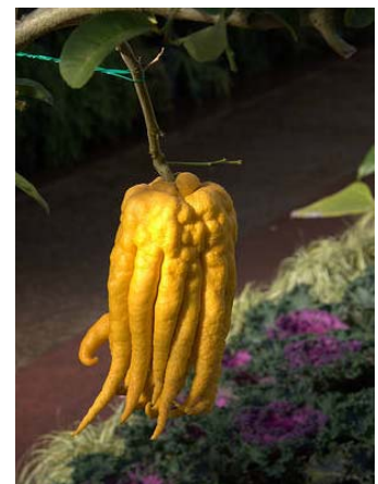
Below: In Asia, the fragrant citron fruit has long been a popular new year's gift, bestowing happiness and long life.