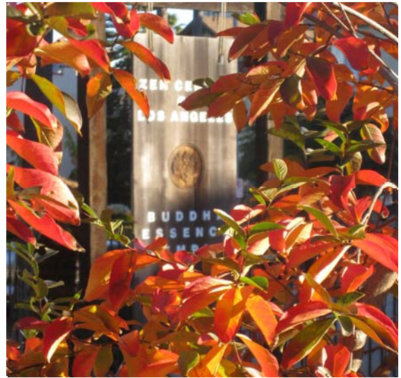
The crepe myrtle tree, coming and going, welcomes the New Year.